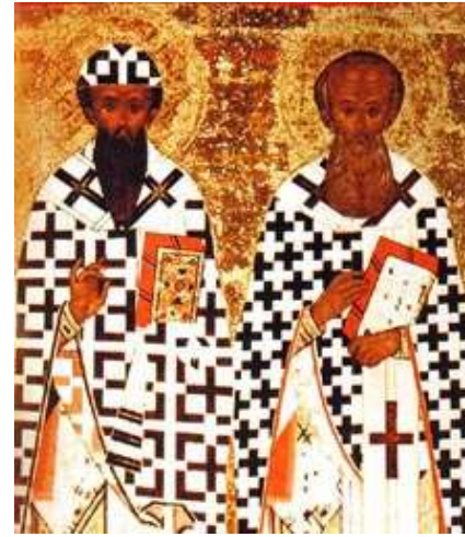
Saint Athanasius and his defence of Nicea

The doctrinal definition of the Nicene Council was not universally accepted throughout the Church for a long time. The Arian controversy raged for over five more decades, and because several Christian emperors in this period gave their support to the Arianizers, the defenders of the Nicene Faith were greatly persecuted. With imperial support, Church councils were held in Milan, Sirmium, Rimini, Seleucia, and elsewhere, to try to articulate the mystery of Christ's divinity and humanity, but all with varying degrees of Arian influence.